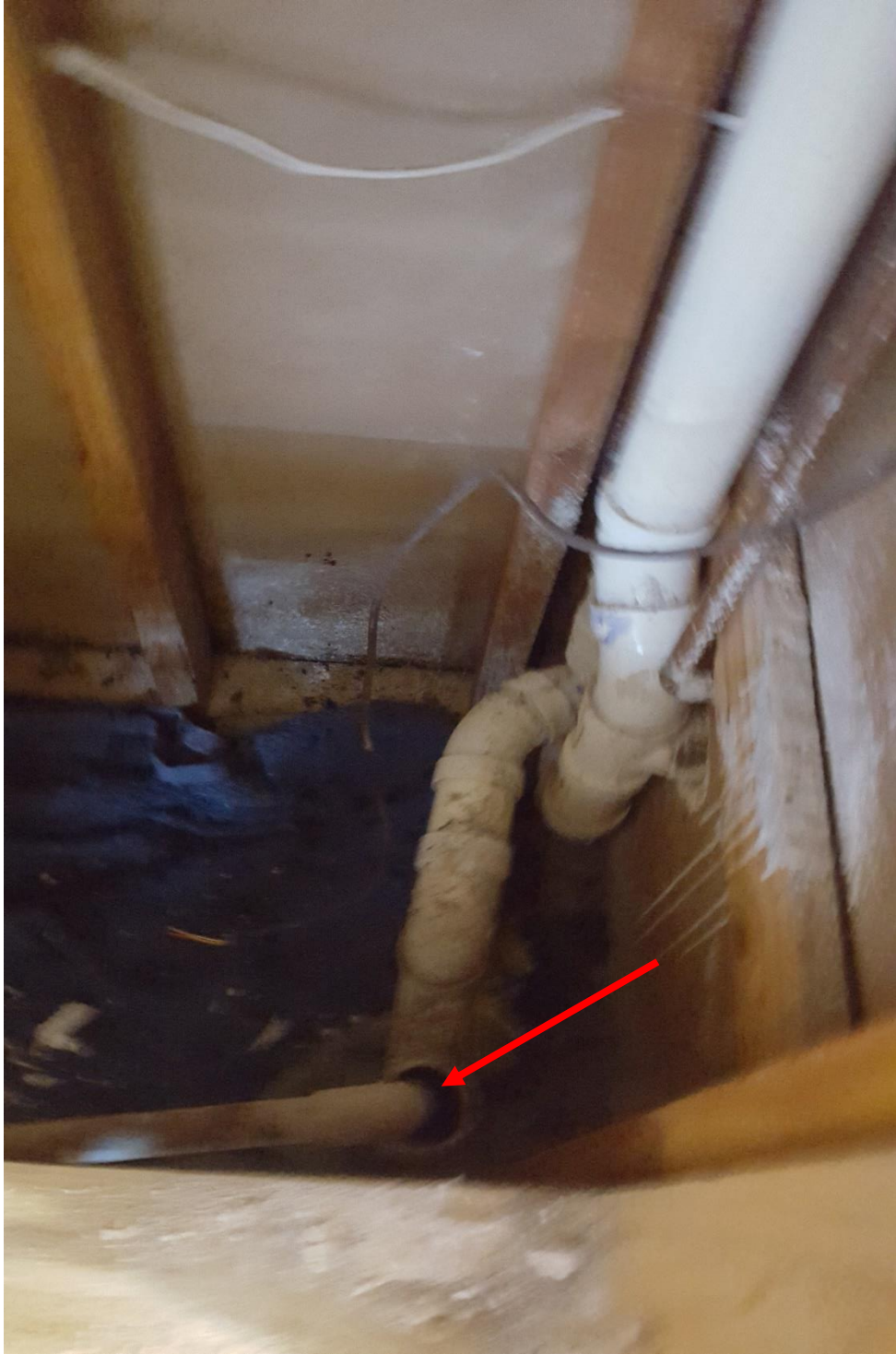
Condensate drain share drain with bathroom sink. Contractor to raise existing sanitary drain (see arrow) above sink level (approximately 2') before installed HVAC condensate drain.